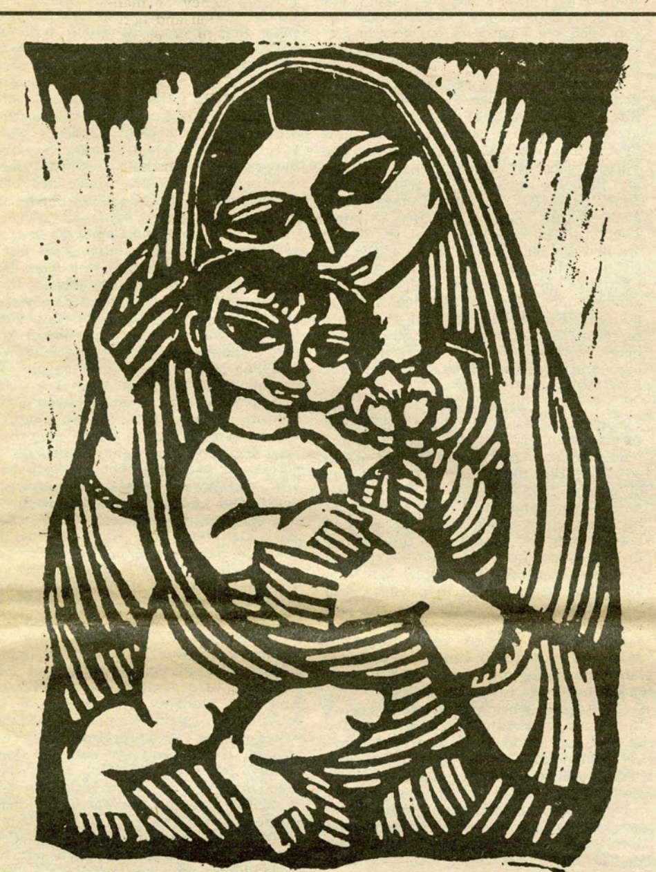
Chitaprosad of India